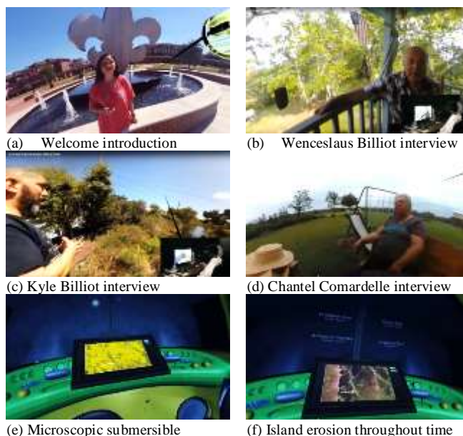
Fig. 2. Oral Histories in VR on erosion in Isle de Jean Charles application screen shots.

In the erosion application, participants toured Isle de Jean Charles and experienced oral history interviews with five of the Island's inhabitants. Students are immersed in a 360-degree video environment with voice narration, shown in Figure 1 on left, to get a first-hand account of how life on the Island has changed. Teleportation was used, in lieu of game-like controller-based walking, to mitigate dizziness or nausea issues that were reported in previous studies [23]. Once the participants put on the VR headset, the application begins with a help screen explaining the controls, followed by an immersive video introducing participants to the application. During the introduction, participants are greeted by an undergraduate student at the University of Louisiana at Lafayette quad, shown in Figure 2(a), who explains the immersive application and the history of erosion on Isle de Jean Charles.