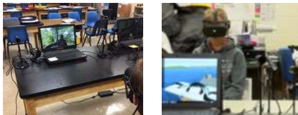
Fig. 1. Erosion study (left) and renewable resources study (right).

In the erosion application, participants toured Isle de Jean Charles and experienced oral history interviews with five of the Island's inhabitants. Students are immersed in a 360-degree video environment with voice narration, shown in Figure 1 on left, to get a first-hand account of how life on the Island has changed. Teleportation was used, in lieu of game-like controller-based walking, to mitigate dizziness or nausea issues that were reported in previous studies [23]. Once the participants put on the VR headset, the application begins with a help screen explaining the controls, followed by an immersive video introducing participants to the application. During the introduction, participants are greeted by an undergraduate student at the University of Louisiana at Lafayette quad, shown in Figure 2(a), who explains the immersive application and the history of erosion on Isle de Jean Charles.