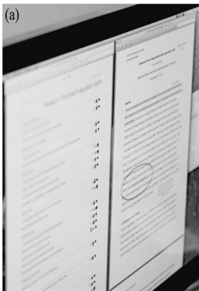
ASEE Computers in Education Division – Draft Paper Rubric

The inspiration for the app came while grading technical reports prepared by students for their term projects at the end of the Fall 2011 term. The students were provided grading rubrics prior to the assignment submission date and asked to submit a PDF version of their final report via email - all in the effort to eliminate hard copies for assessment purposes. During the evaluation stage of such an assignment, an instructor would typically display the rubrics besides the student report while reviewing and grading. An example of this process can be seen in the desktop screenshot provided in Figure 1(a). This particular approach uses annotation features of a PDF viewer to grade the report and