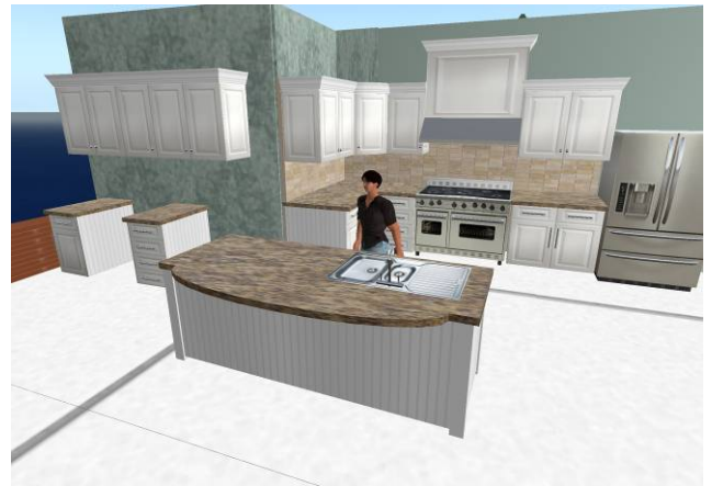
Figure 7: Virtual Living Space: kitchen area.