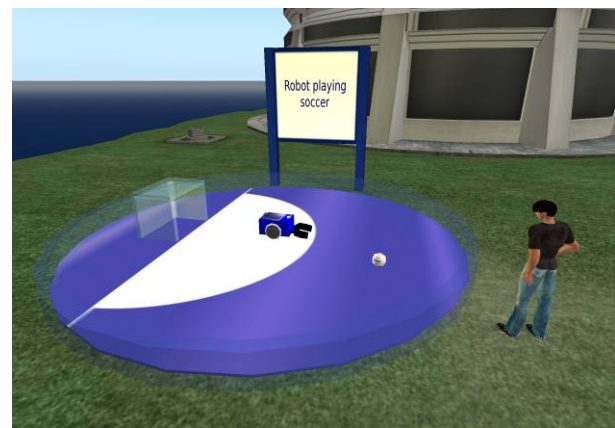
Figure 2: IEEE Virtual Robot Demonstration.

Another relevant and presently existing site is the IEEE virtual presence in Second Life. This site is currently used for meetings, professional talks, and to promote the mission of the IEEE organization. The Robotics and Automation Society (RAS) has sponsored robotics demonstrations on the site that may be accessed by any of the users of Second Life [3]. Included in the suite of demonstrations is a path following robot, a soccer playing robot, and a virtual bartender robot. One of the animated demonstration exhibits is shown in Figure 2. An avatar (operated by this author) is shown in the image interacting with the robot demonstration.