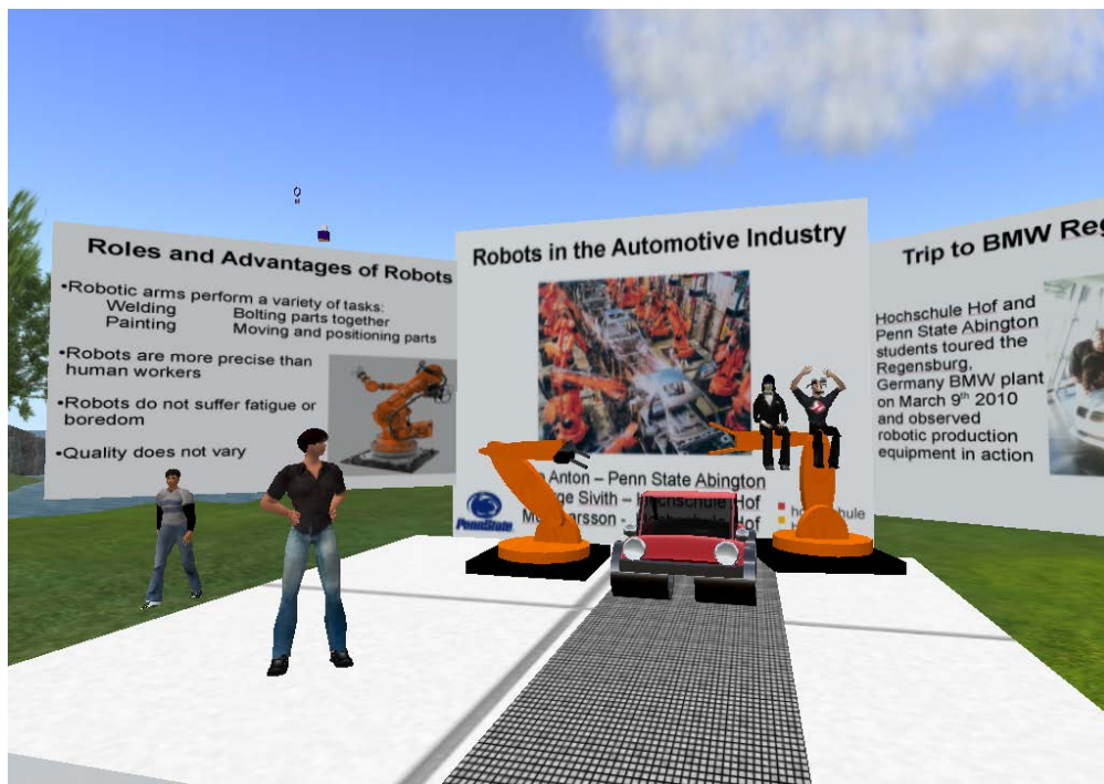
Figure 3: Student Robot Exhibit in International Course.