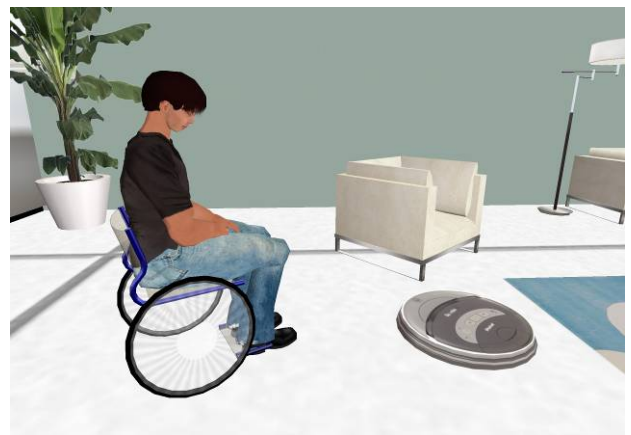
Figure 8: Avatar in wheelchair with floor robot.