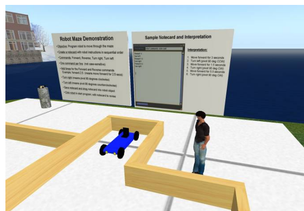
Figure 5: Virtual Robot in Maze

Our second initiative is the development a 3D virtual living space that can be used to model and evaluate human-robot interactions. As can be seen in Figures 6 and 7 below, a virtual 3D living room space and kitchen have been constructed in Second Life. Many of the individual furnishings depicted (including furniture, appliances, etc) in the figures below have been purchased for a nominal fee inside the virtual world and these appliances were originally designed and built by other residents. The availability of such materials and resources minimizes the time and cost to setup realistic living environments. Faculty and several students collaboratively established this virtual living space in several hours of time. Within