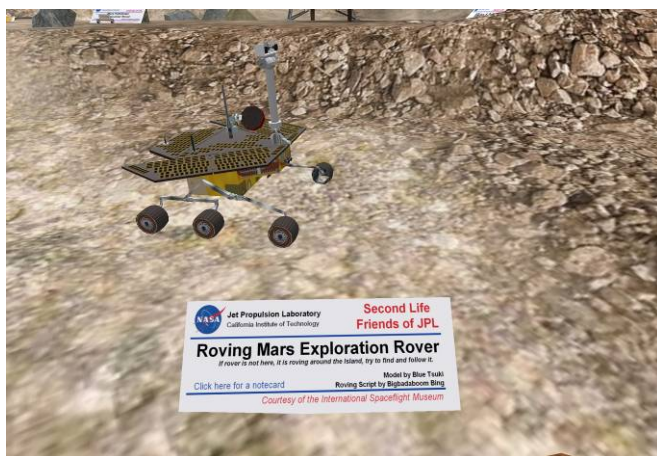
Figure 1: NASA Virtual Robot Demonstration.

exhibits related to the ongoing space programs supported by NASA. Meetings and educational presentations are also held for staff and the public at this site. Some of the builds and exhibits are constructed and maintained by volunteers working with the NASA organization and professionals throughout the world. One of the exhibits shown below (Figure 1) is a virtual 3D model of the Mars rover. The rover is animated and moves across a simulated Martian surface. The virtual site also provides interactive links to additional information concerning the Mars mission and the role of robotics to support mission goals.