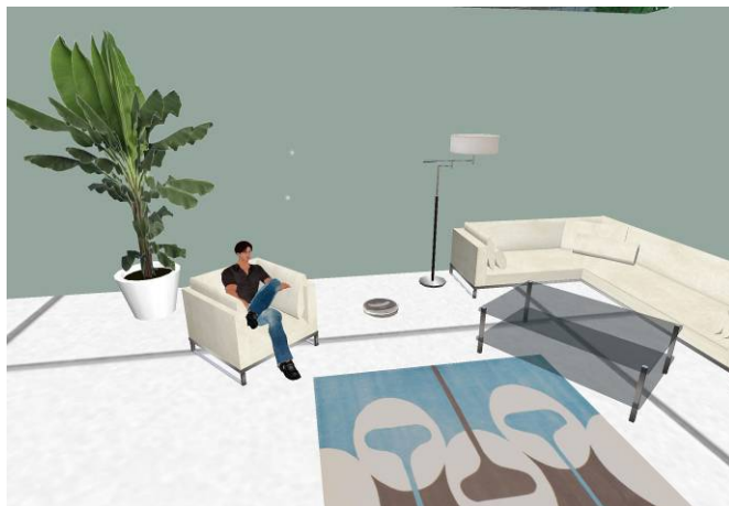
Figure 6: Virtual Living Space with floor robot.

It is relatively easy to reconfigure furniture and to add avatars and a variety of robots into the virtual environment to evaluate the interactions. We have succeeded in our effort to determine the feasibility of designing a virtual living space to study the interaction of human and a simple robot. We are currently designing other robot models and human-robot interaction scenarios and studies. These results may have a very positive impact on the study of robots in the areas of smart homes, elder care, aging-in-place, accessibility, emergency response, and safety in a living environment shared with robots (see Figure 8). This virtual approach provides a very low-cost solution to prototyping solutions in a 3D interactive environment and also has the advantage of sharing results with an international audience. The ability to engage cooperatively and interactively is one key advantage of virtual worlds over other simulation tools. We are planning to perform additional testing in this virtual living environment and also to share the environment with other students and researchers interested in utilizing virtual world technology to promote this technology.