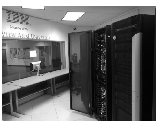
(a) HPC cluster platform.